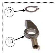
DETAIL, PAWL MOUNTING DIRECTION.